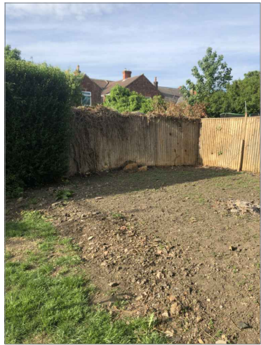
IMAGES OF SITE